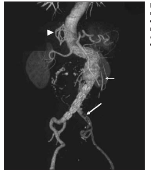
Figure 2. Day 10 CT angiography. 3D reconstruction image showing type 1 endoleak (small arrow) and partially recanalized left common iliac artery (big arrow) as well as the inferior vena cava filter (arrowhead).

ren, New Jersey, USA) was placed in the suprarenal inferior vena cava at the level of hepatic veins via the same venous access. Subsequent conventional aortogram findings were consistent with CT findings with regard to the left common iliac artery stump. Furthermore, the right external iliac artery was found to be significantly angulated, with a maximum diameter of 5.5 mm. Endovascular aneurysm repair was scheduled for the next day. Because the left common iliac artery occlusion was asymptomatic, aortouni-iliac endograft was the treatment of choice. On the following day, the infrarenal AAA was excluded from the circulation by placing a 34-16 x 170 mm Medtronic Talent (Medtronic INC, Minneapolis, Minnesota, USA) aorto-uni-iliac endograft. The left re-