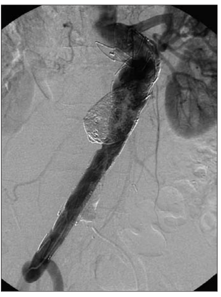
Figure 5. Final aortogram showing patent aorto uni-iliac graft with no endoleak.