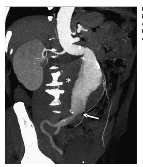
Figure 1. Reformatted CT angiography image. Large abdominal aortic aneurysm with significant neck angulation and mural thrombus (asterisk) . Additionally, left common iliac artery is occluded (arrow) .