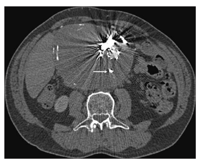
Figure 6. Sixth-month control axial CTA image at arterial phase showing patent endografts with no endoleak. Coil pack causing striking artifact, and the glue cast at the posterior aneurysmal sac (arrow) can be seen.

sonographic guidance, a 6F introducer sheath was placed through the left common femoral artery into the left external iliac artery. After visualizing the exact course of the proximal type 1 endoleak through the partially recanalized, a 4F catheter was advanced into the caudal portion of the sac, followed by placement of a coaxial microcatheter (Rebar 18, Micro Therapeutics, INC, Irvine, California, USA) within the proximal endoleak cavity just below the level of renal arteries. Through the microcatheter, multiple detachable platinum coils (Micrus