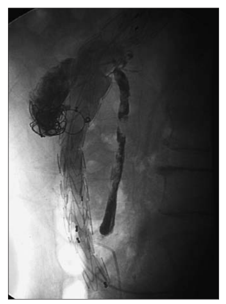
Figure 4. Lateral aortogram showing the glue cast as well as microcoils along the course of the endoleak.